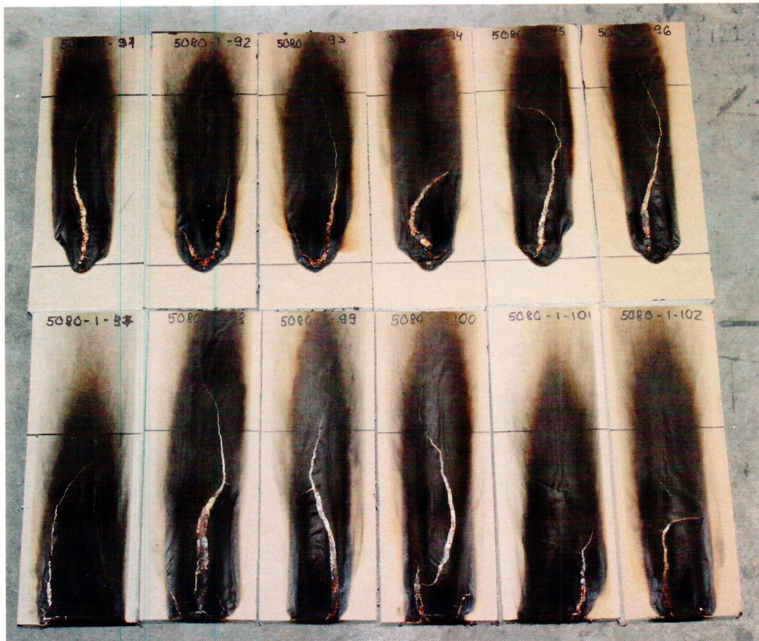
Fig.2. Specimens with 25 mm thickness after tests.