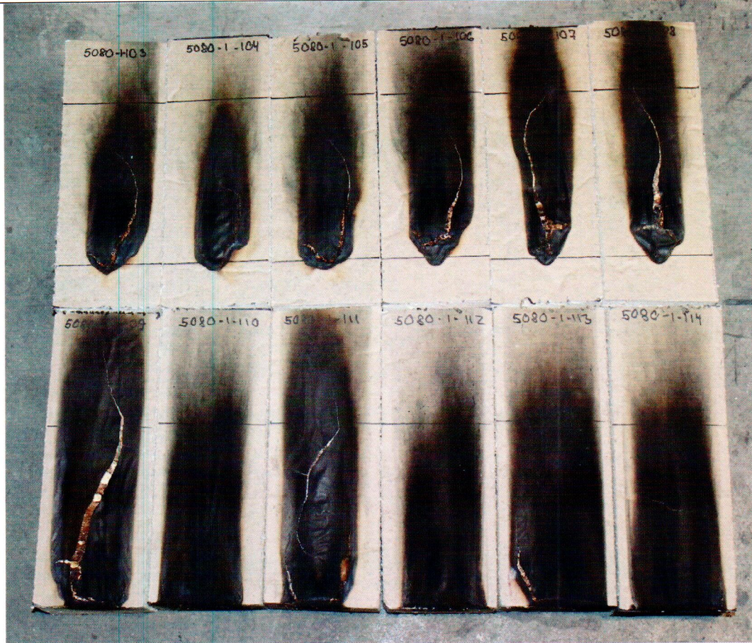
Fig.3. Specimens with 60 mm thickness after tests.